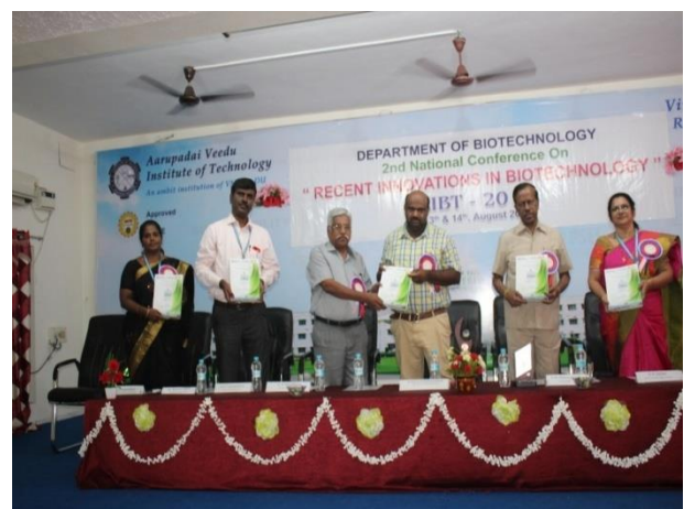
CONFERENCE PROCEEDING RELEASE